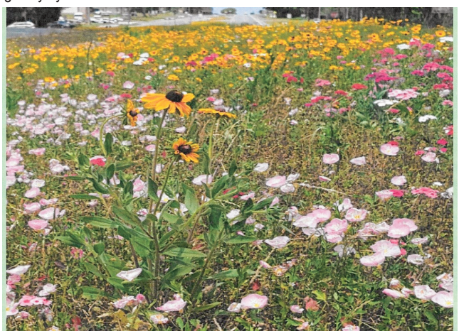
US 41 S. in Columbia County from CR-252 to St. Margaret's Street may be short in length; but not in species of Wildflowers!

DISTRICT II LAKE CITY MAINTENANCE - The medians within a two-mile section of US 41 South in Columbia County exemplify a successful project that includes Naturally Occurring and Seeded Florida Wildflowers coexisting and flourishing. A beautiful mix of Coreopsis basalis, Black-eyed Susan (Rudbeckia hirta), Moss Verbena (Verbena tenuisecta), Showy Primrose (Oenothera speciosa) Rain lily (Zephyranthes candida) and Fleabane (Erigeron guercifolius) benefits pollinators and delights travelers each spring. Two Naturally Occurring Wildflower projects; one a 34-mile section of Hwy US 27 from Branford to the Alachua County Line and the other US Hwy 27 from the Ichetucknee River Bridge through Fort White, highlight District II projects where mowing schedules have been carefully planned to allow native wildflowers time to seed and space for continuing naturalization year after year. Yellow Coreopsis basalis and pink Phlox drummondii are visually beautiful for many miles. Each project is a noteworthy example of professional roadside management. Leading by example, Lake City Maintenance shows that roadsides can be safe and appear cared for without destroying wildflower areas. The Lake City approach to conserving roadside wildflowers is impressive and repeatable nearly anywhere along the state highway system.