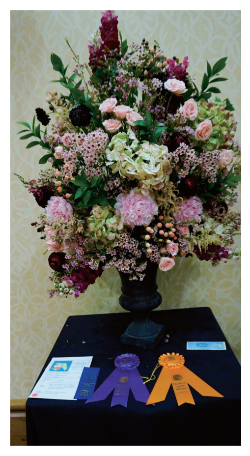
Award -winning Flower Arrangement