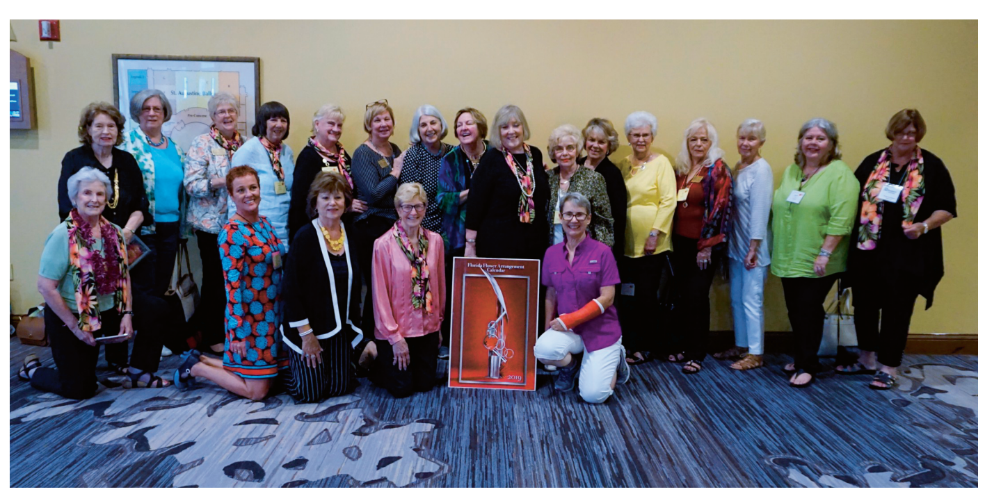
The 2019 'Calendar Girls' pose with a photograph of the Calendar.