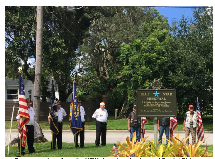
Representatives from the VFW, American Legion and Patriot Riders comprised the Color Guard

On a hot and humid September 12th, 2018, a moving the prize monies which were earmarked for a Blue Star provided the additional money needed to acquire the marker.